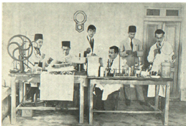
Figure 1: A heritage photo of Pasteur Institute researchers [16].

One of the modern sections of the Pasteur Institute of Iran, the Biotechnology Department, has been a pioneer in molecular biotechnology investment over the past years. The investment in molecular biotechnology was then continued by the National Research Centre for Genetic Engineering and Biotechnology (NRCGEB). In 1988, the Iranian Ministry of Science, Research and Technology supervised